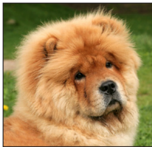
An All-star team of law enforcement officers and Santa Fe and Taos advocates worked with APNM to successfully remove 25 Chow Chow mixes and a litter of puppies from an animal hoarder living in a van in Taos County.

• APNM's strategy of "helping communities make kind choices" involves ongoing training of law enforcement officials in effective animal cruelty investigations. Toward that end, APNM collaborated with both the AG and the New Mexico Sheriffs and Police Association (NMSPA) to conduct training on animal fighting investigations at the NMSPA's March 2008 conference. Experts from the Humane Society of the United States delivered this unique training to over 100 officers.