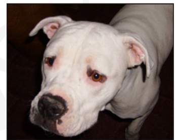
Trinity has a wonderful home today.