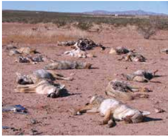
Coyote killing contest victims