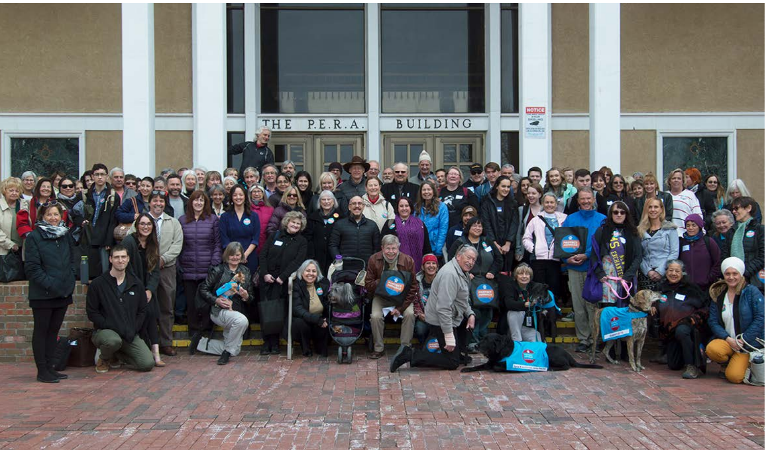
Animal Protection Lobby Day attendees