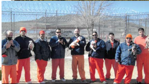
The Animal Connection at Central New Mexico Correctional Facility

An Animal Protection of New Mexico staff member is serving as a citizen member of the Sandoval County Free-Roaming Horse Advisory Council, tasked with studying issues and making recommendations to the Sandoval County Commission regarding the Placitas wild horses. This is an important opportunity for our expertise to help the community find consensus around humane, sustainable management and protection for the horses.