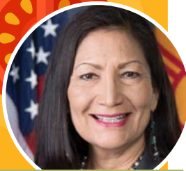
Congresswoman Deb Haaland