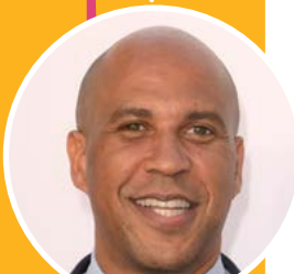
Senator Cory Booker