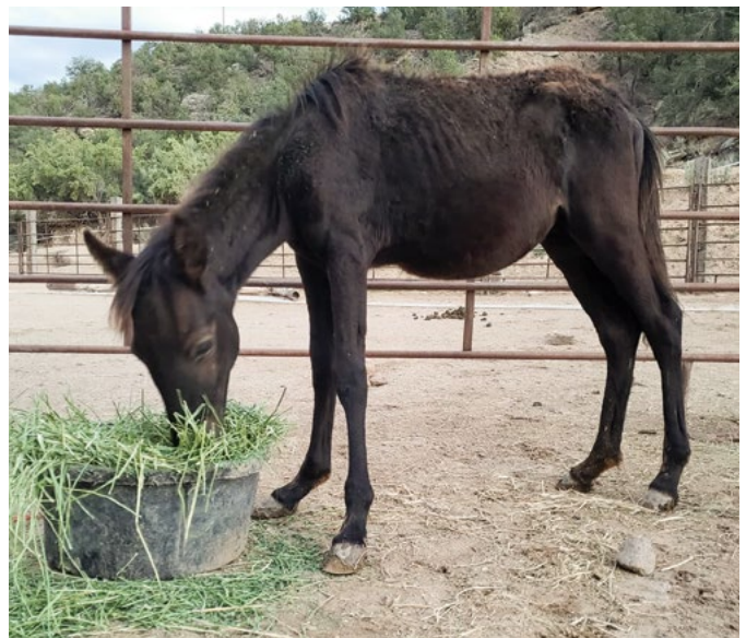
Top photo: Dolly resting after breakfast; bottom photo: Dolly enjoys high quality hay.

Dolly's case illustrates that healing and helping can be magnified when our community works together.