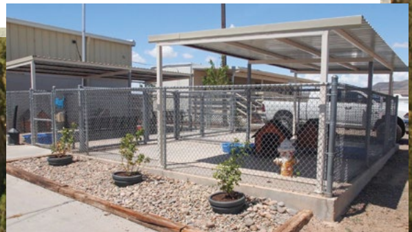
The new Meet and Greet area at Valencia County Animal Shelter